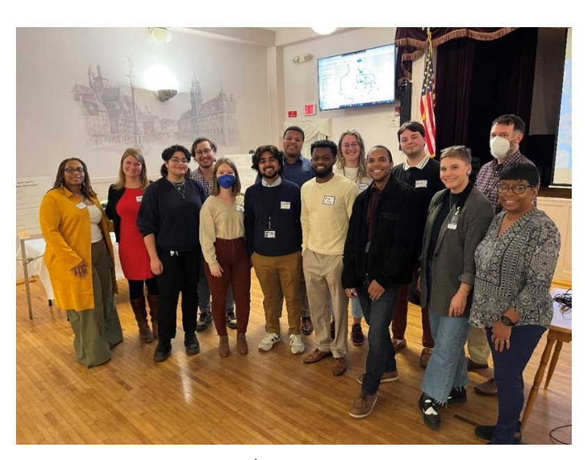
FIGURE 1: PARTNERS FROM THE CITY'S COMMUNITY DEVELOPMENT AND PLANNING DEPARTMENTS AND SLAVIC VILLAGE DEVELOPMENT STAFF GATHER FOLLOWING THE COMMUNITY VISIONING OPEN HOUSE

The Community Visioning Open House was held on November 2, 2023, from 4pm-7pm at the Polish-American Cultural Center. Slavic Village Development (SVD), the City of Cleveland, and Councilwoman Maurer collaboratively planned and staffed the event.