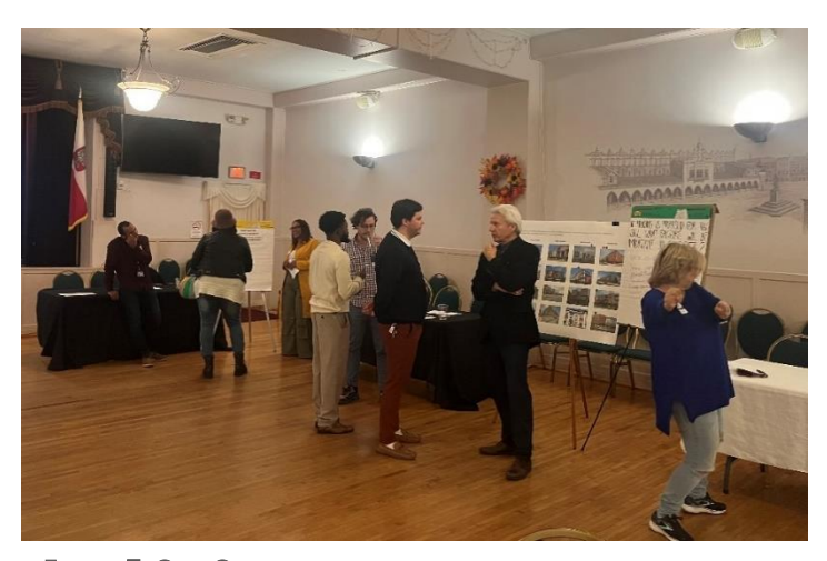
FIGURE 7: CITY CLEVELAND EMPLOYEES SPEAK WITH RESIDENTS IN FRONT OF QUESTION BOARDS AT THE OPEN HOUSE

By shedding light on neighborhoodspecific priorities and concerns, our