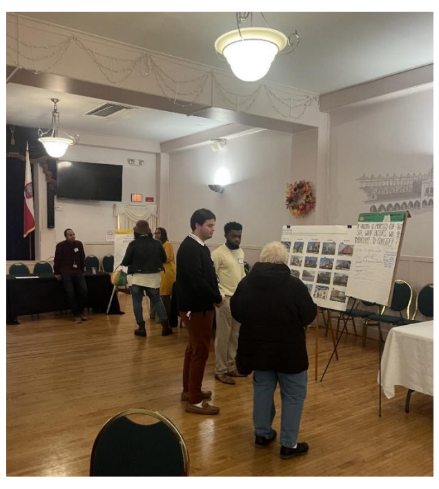
FIGURE 5: CITY OF CLEVELAND EMPLOYEES SPEAK WITH RESIDENTS AT THE OPEN HOUSE

Third spaces are spaces where social interaction can take place outside of the home and workplace, and are open and accessible to the surrounding community where people can gather. Multiple residents mentioned the desire for an increase in third spaces in the community to foster current connections and increase familiarity with those they do not yet know. When asked about gaps in services and amenities in the neighborhood, one resident responded with "More access for fresh prepared meals, coffee, gathering spaces, more activities for kids and youth, [and] playgrounds on or near Fleet [Avenue]." One resident stated, "Coffee shop spurs community dialogue and connectedness,"