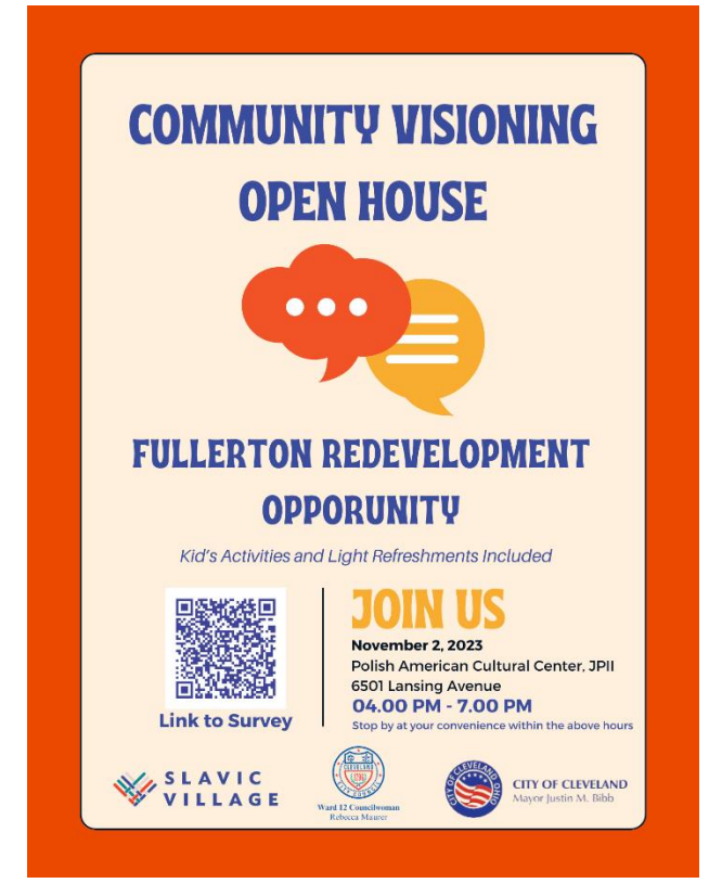
FIGURE 3: FLYER USED TO MARKET THE OPEN HOUSE IN THE WEEKS LEADING UP TO THE EVENT

CMSD supported marketing efforts by including the information for the open house and survey in a postcard directly mailed to approximately 1,300 residents, the most widespread of the marketing efforts. This postcard also included